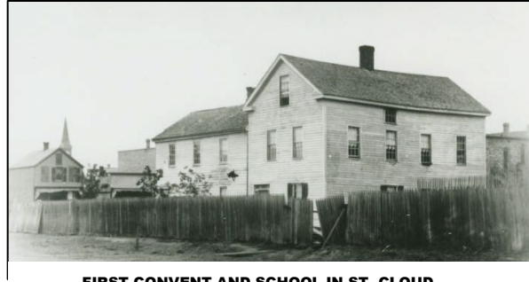
FIRST CONVENT AND SCHOOL IN ST. CLOUD